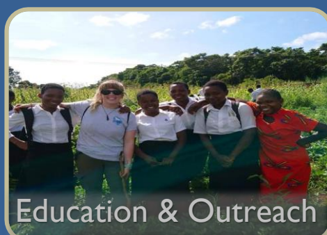
Education & Outreach