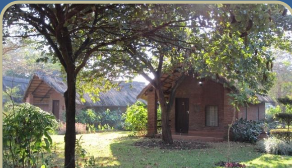
Urban Research Centre Lilongwe